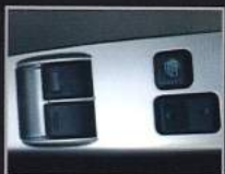
Power Window and Central Lock