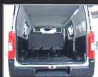
Ample Cargo Space