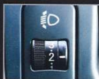
Adjustable Head Lamp