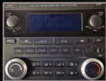
Multi-Function Audio System