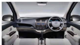
Modern and well-equipped cabin for everyday driving.