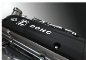
New DOHC engine for optimum performance.